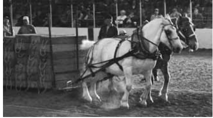
Pioneer Fuels Horse Pull Sunday, September 27, 4:15pm

PROUD SPONSOR OF THE HANTS COUNTY EXHIBITION